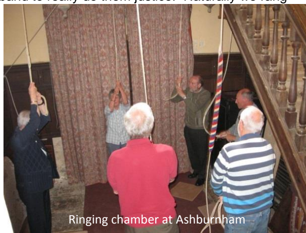
Ringling chamber at Ashburnham