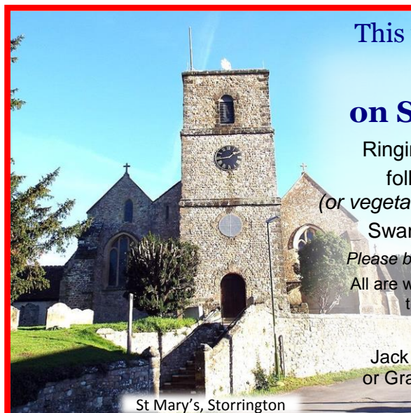
St Mary's, Storrington

This year Western Division's Social Event is a BEETLE DRIVE