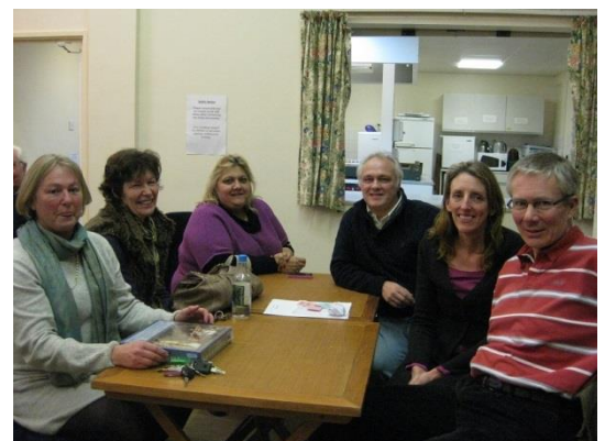
Winning team – "The Grapplers" from Graffham