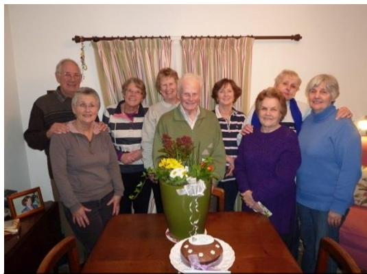
The Aldingbourne ringers who were able to be present on the occasion

The 16 th January 2013 was the date of a significant birthday for me as I celebrated my 80 th on that day. I felt that I could not let it pass without an attempt at some sort of celebration, but little did I know that others also thought likewise, most notably my local tower at Aldingbourne.