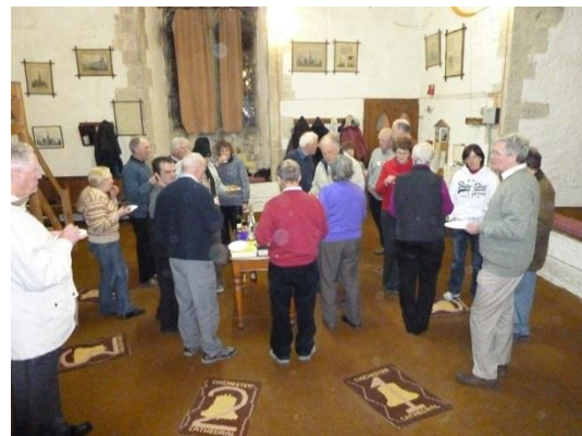
An overview of the cathedral ringers who had come to help me celebrate

Finally, a very big THANK YOU to all who made my birthday so special!