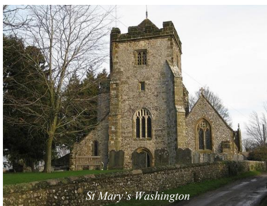
St Mary's Washington

jeburton@alverservices.com to enter your band