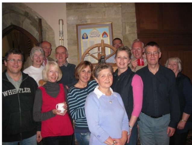
Students & helpers at Wisborough Green