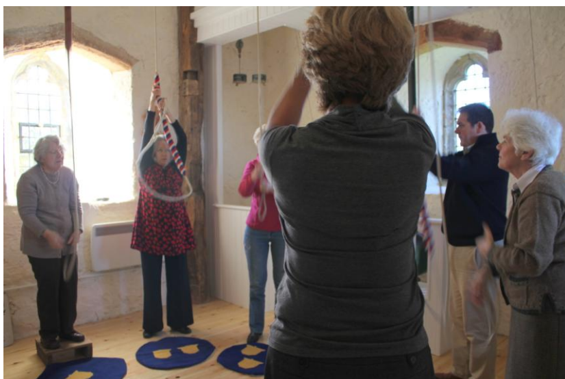
View of the new Ringing Room at Hartfield.

At St Mary's the Virgin Hartfield the PCC, as part of their on-going renovation work, have for some time wanted to use the west door as the main entrance to the church. However, this was where the Belfry was situated. To achieve their aim the PCC have moved the ringers up one floor to the clock room above. This has given an excellent new ringing room - a domain with which the bell ringers are well pleased. To keep contact with the Church Services there has been a 3 way camera installed to link the bell chamber and the new Ringing room to the Church. This has created interest for those below in what is going on up above. The new Ringing room is approached via a steep spiral staircase - so not only have the Ringers gone up in the world, they are expecting to be fitter too!